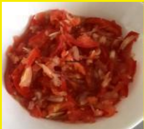
an other popular dish of Kenya: ugali, sukuma wiki, greens